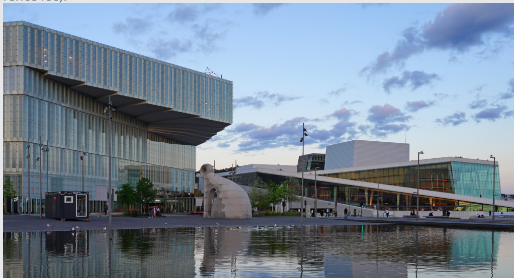
Picture of the Munch museum and the Opera House.

Conference dinner at the Oslo Opera House, restaurant Havsmak (included in the conference fee).